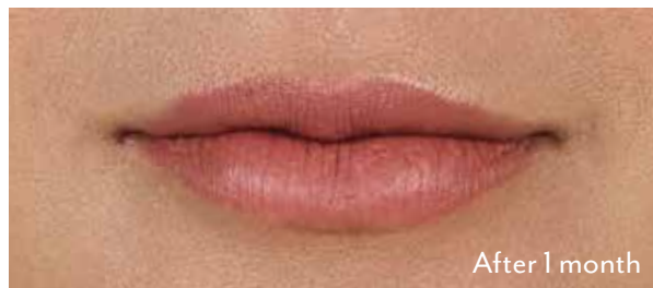
After 1 month

Ask us how you can get subtle, long-lasting results with JUVÉDERM VOLBELLA® XC.