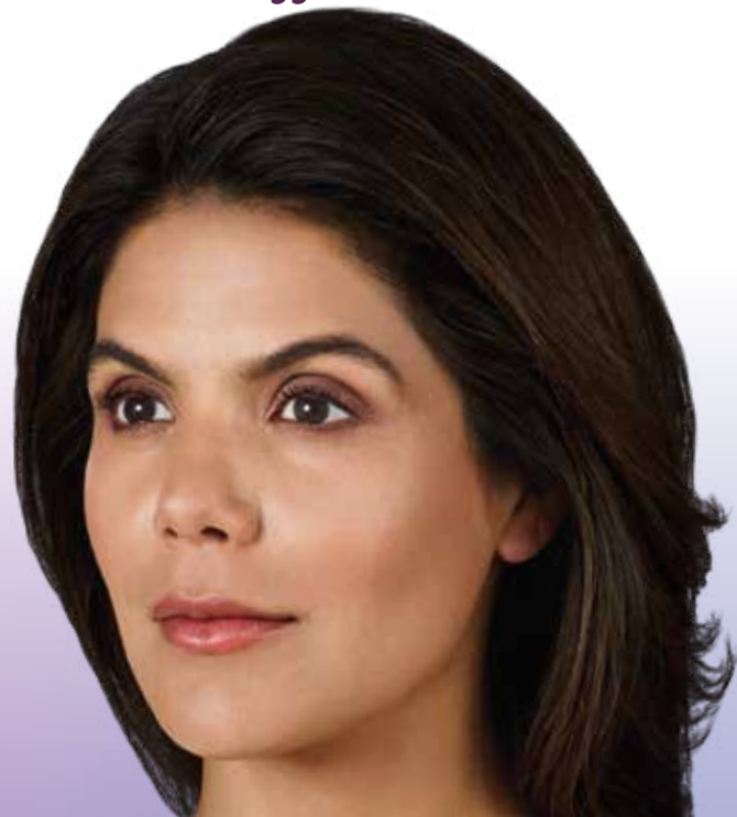
After 1 month